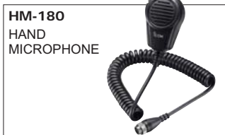
Dynamic microphone with IPX7 waterproof protection. Same as supplied.