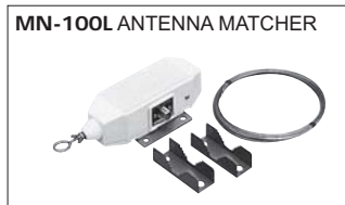
Match the transceiver to a long wire antenna. Covers all HF bands from 1.5 to 30 MHz. 15 m×1 antenna wire comes attached.