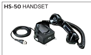
Provides clear audio reception and comes in handy for listening privacy.