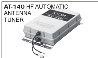
Matches the transceiver to a long wire antenna with little insertion loss. AT-130/E is also available.

Some options may not be available in some countries. Please ask your dealer for details.