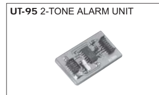
Provides the alarm function. Already built in to the Marine version.