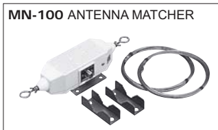
Match the transceiver to a dipole antenna. Covers all HF bands from 1.5 to 30 MHz. 8 m×2 antenna wires come attached.