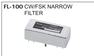
Have good shape factor to provide better CW/RTTY reception. Bandwidth: 500 Hz–6 dB