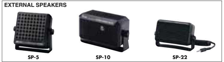
SP-5 : Large external speaker. SP-10 : Mid sized external speaker. SP-22 : Compact and easy-to-install external speaker.