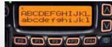
Two line setting display example.

With a high contrast dot matrix display, upper and lower case characters can be easily distinguished. You can change the display setting to show one line and 12 characters, or two lines and 24 characters via programming. LCD backlighting is standard.