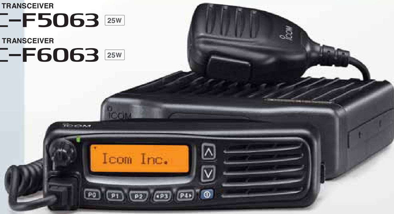
The above photo includes optional separation kit, RMK-3, and separation cable, OPC-609.