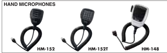
HM-152 : Regular microphone. Same as supplied. HM-152T : DTMF microphone. HM-148 : Dynamic microphone for heavy duty use.

Some options may not be available in some countries. Please ask your dealer for details.