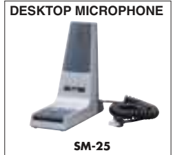
SM-25 : Convenient for dispatching, equipped with monitor switch.