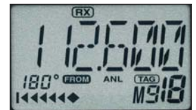
CDI mode display

The IC-A24/E has VOR navigation functions. The DVOR mode shows the radial to or from a VOR station and the CDI mode shows the course deviation to/from a VOR station. You can also input your intended radial to/from the VOR station and show the course deviation on the display. In the USA version, the duplex operation allows you to call a COM channel, while you are using VOR navigation. (* IC-A24/E only)